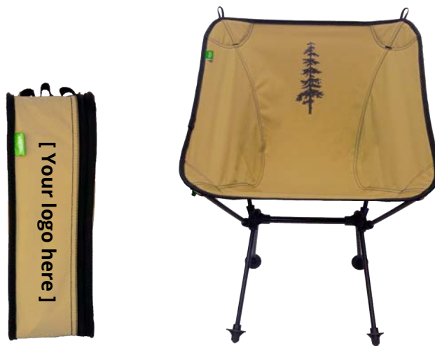
Best selling shocked cord chair with Repreve® fabric