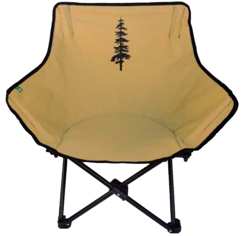
Amphitheater, Beach, Concert chair with recycled Repreve® Fabric