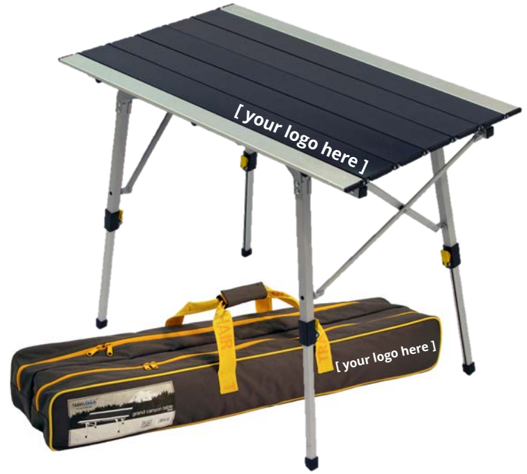
Sturdy table with multiple dining and prep height options.